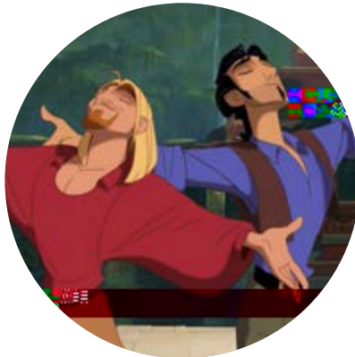
FILM The Road to El Dorado

This is a weird movie for me to write about. It has a large cult following, but barely anyone has seen it. It was made by DreamWorks, and immediately got overshadowed by their other smash-hit movies, so it never really got the reception it needed. The story follows no conventional trends, it goes all over the place, exploring new themes and ideas all the time. It is loosely based around its main characters Tulio and Miguel are con men by trade, and they start the movie rigging a game of dice to win a map to the ancient city of El Dorado. They get found out, obviously, there needs to be some action sequence where both pretend that they did not know the other one rigged merchant stands, spewing one liners all the while. They escape, but not before being forced onto a ship of conquistadors, coincidentally, heading to the lost city of gold, El Dorado. As an aside, the music in the movie is all amazing, not a single song feels out of place. I need to cut this review short, and although I probably did not convince a single person to watch the movie, I urge you to at least give it a chance. It is a fantastic adventure story with the right amount of tension and