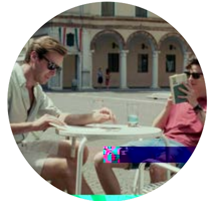
FILM Call Me by Your Name

Call Me by Your Name is one picturesque, romantic coming-of-age movie set in the blossoming romantic relationship between 17-year-old local Elio and visiting doctoral student Oliver, who together discover of northern Italy.